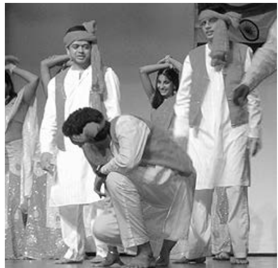
Members of the Indian Student Association of Western Michigan University present a dance during the Holi celebration on March 13, 2004 at the Latvian Heritage Center, Kalamazoo.